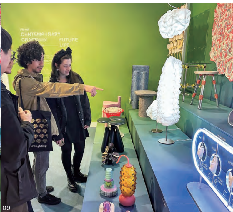
09 觀展者對於燈具製程手法產生興趣 Visitors were fascinated by the method used to make the lamps.

I am very proud of my university.” She said that both the students and faculty had invested enormous amount of time and energy, from theme setting, exhibition space arrangement, promotion strategies to training in English presentation. Despite the challenges, she felt all the efforts were worth it when visitors enjoyed their work and found a sense of identity. “Thanks to the professors and the collaboration of classmates, I had the unforgettable opportunity to learn and grow,” she said.