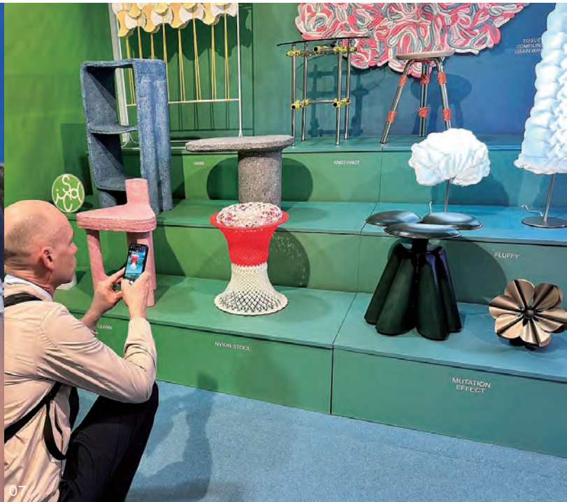
06 透過專刊使觀展者更瞭解展品的概念與發想 The special issue helped visitors learn more about the concepts and design of the work.