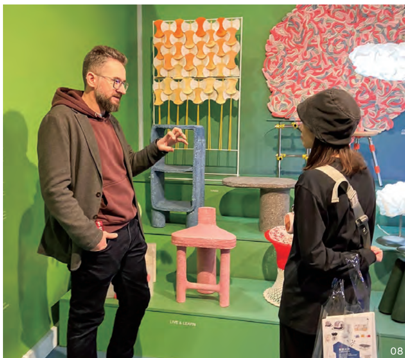
08 觀展者向參展學生熱情分享對作品的感受 A visitor shared how he felt about the work with student.