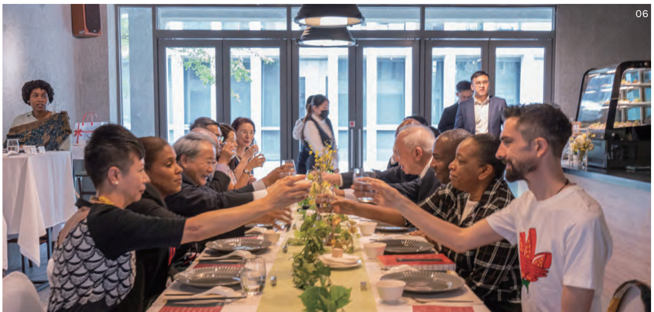
06 聖露西亞代表團來訪歡迎午餐 Welcome luncheon for the Saint Lucia delegation